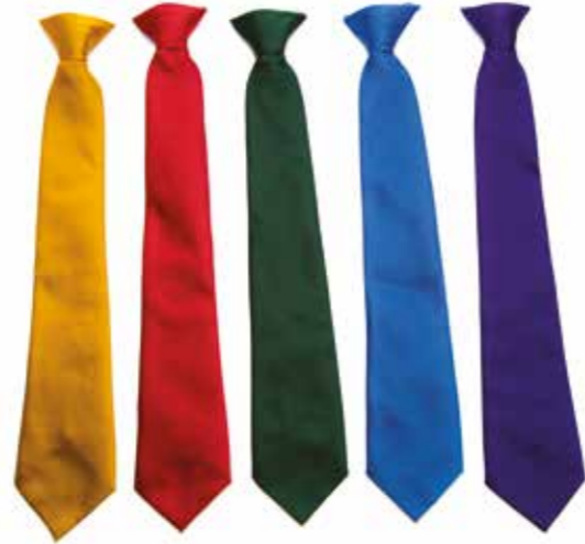
College System Ties

Students also play an integral part in the interviewing and recruitment of new staff.